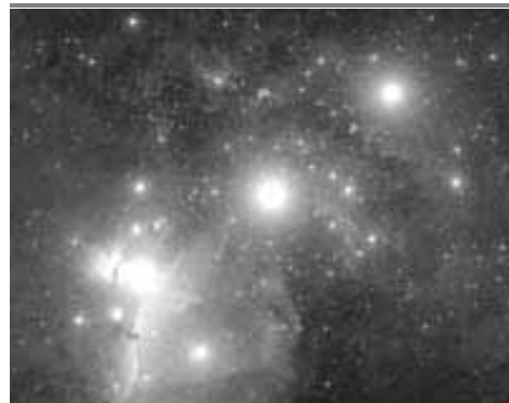
Astronomers have discovered a cloud of methyl alcohol nearly 300 billion miles across in the region of space known as W3(OH).