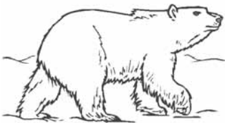
Despite sub-arctic temperatures, there were no reports of polar bears near Doyle Park!

Has God been bugging you to volunteer for some kind of AA service? This might be the perfect fit for you. Call me and I'll hook you up with a commitment.