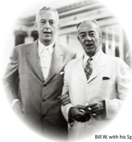
Bill W. with his Sponsor, Ebby T.