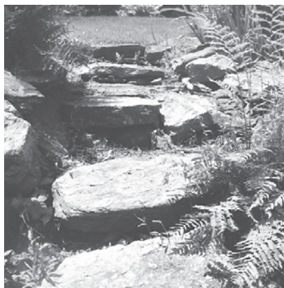
STEP BY STEP Real AAs, Real Recovery